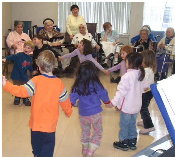
An intergenerational program was held in January with the Residents' Choir. Children from a local daycare sang songs with the choir and mingled with the residents.

► We have recruited 38 new volunteers since November, and our recruitment campaign is continuing.