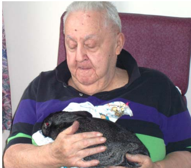
The warmth and soft fur of this visiting bunny rabbit intrigues our residents and provides a very soothing experience. Everyone is encouraged to hold and pet various friendly animals during pet therapy sessions, including a dove, a turtle and a cuddly dog.